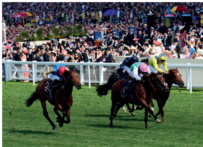
Haatem winning the Jersey Stakes on Day 5 of Royal Ascot 2024