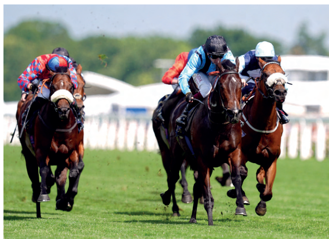
Asfoora winning the King Charles III Stakes on Day 1 of Royal Ascot 2024