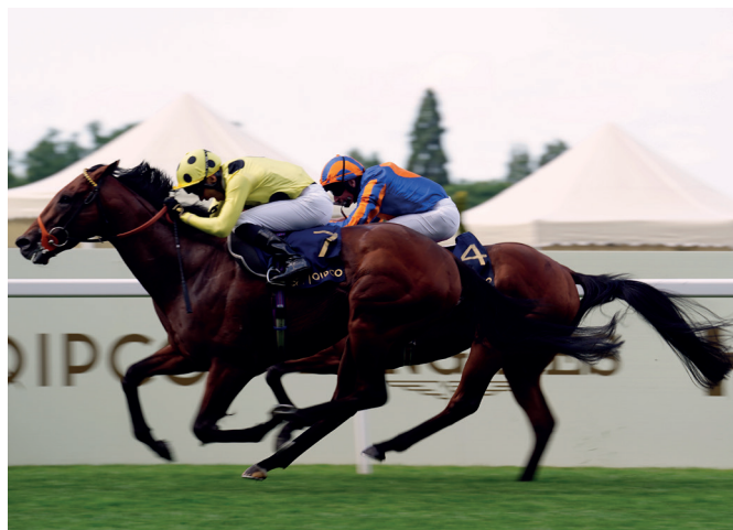
Rosallion winning the St James's Palace Stakes on Day 1 of Royal Ascot 2024